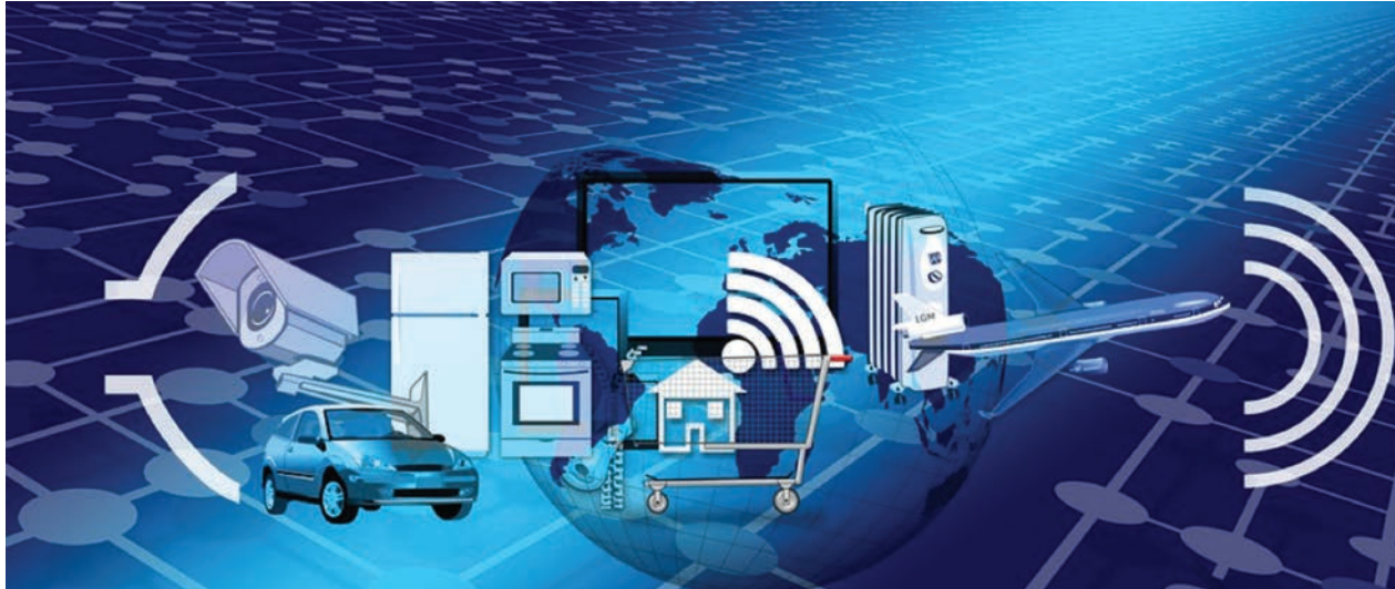
Figure 1.2: ICT Around Us

digital television. In addition to printed newspapers now we also have their electronic versions. Along with traditional radio, we also have online radio.