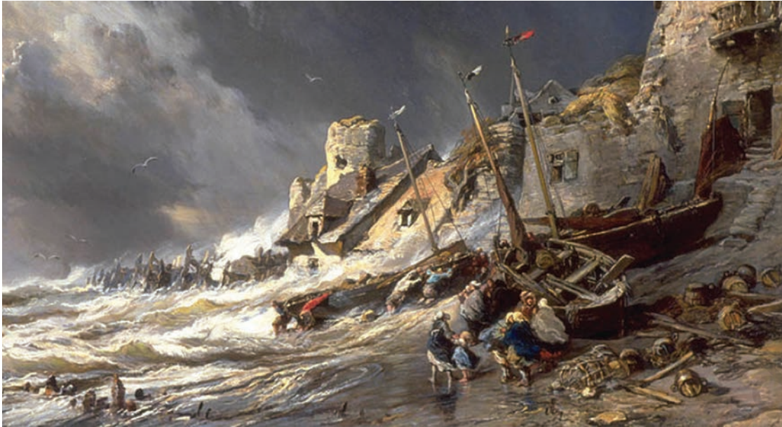
Figure 1.1: Coast Scene

Technology refers to methods, systems and devices, which are a result of scientific knowledge, being used for practical purposes. For example, Muskan went to an excursion to Bhubaneswar and visited the State Museum. She saw various mineral ores in the mineral section of the museum. She decided to capture photographs to share with others who may not have seen the ores. She borrowed her teacher's mobile and clicked pictures of the rare collection. She shared all the pictures on her blog along with a description of the ores. Many viewers commented and appreciated Muskan for sharing those pictures and description.